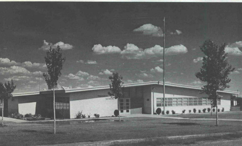
Elementary School Carlsbad, New Mexico 1954