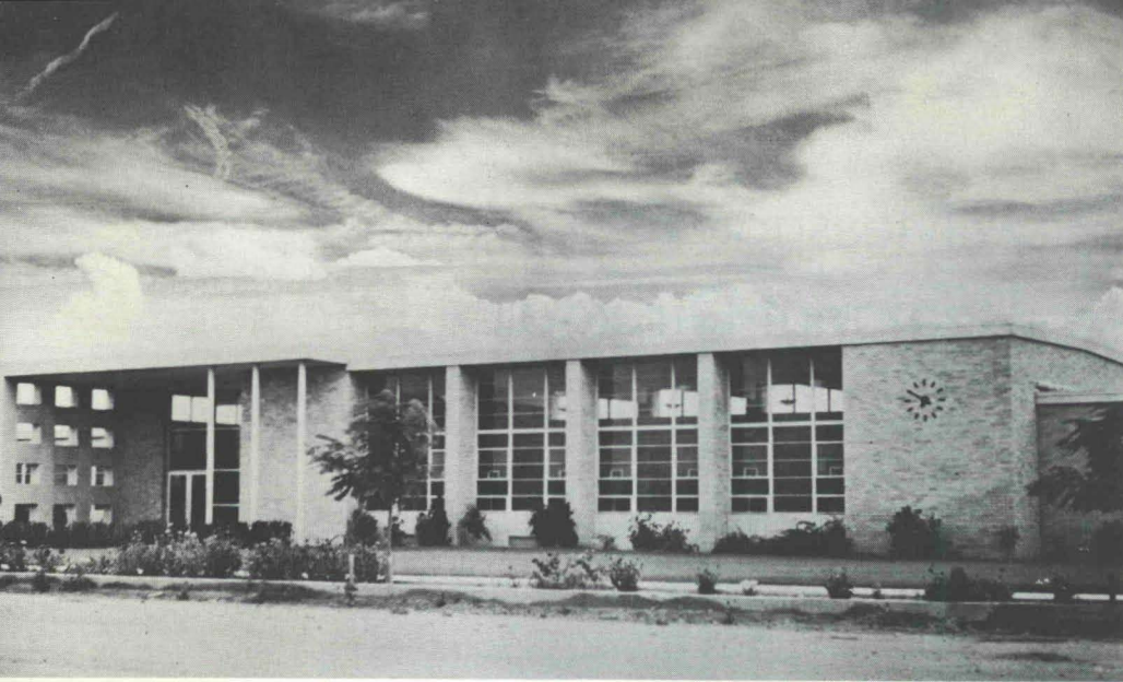
Tatum High School Tatum, New Mexico 1952