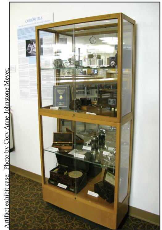
Artifact exhibit case.