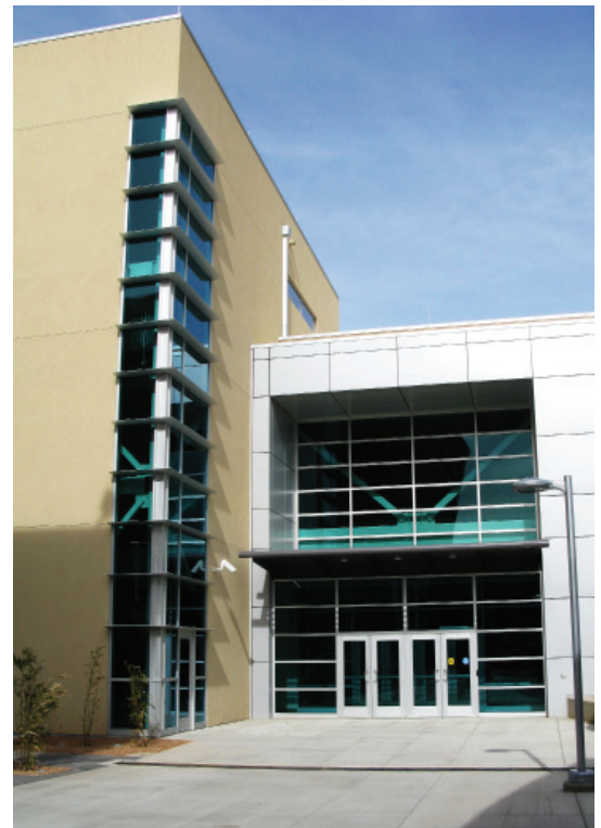
Domenici Center for Health Sciences Education, Phase II, entrance and courtyard.